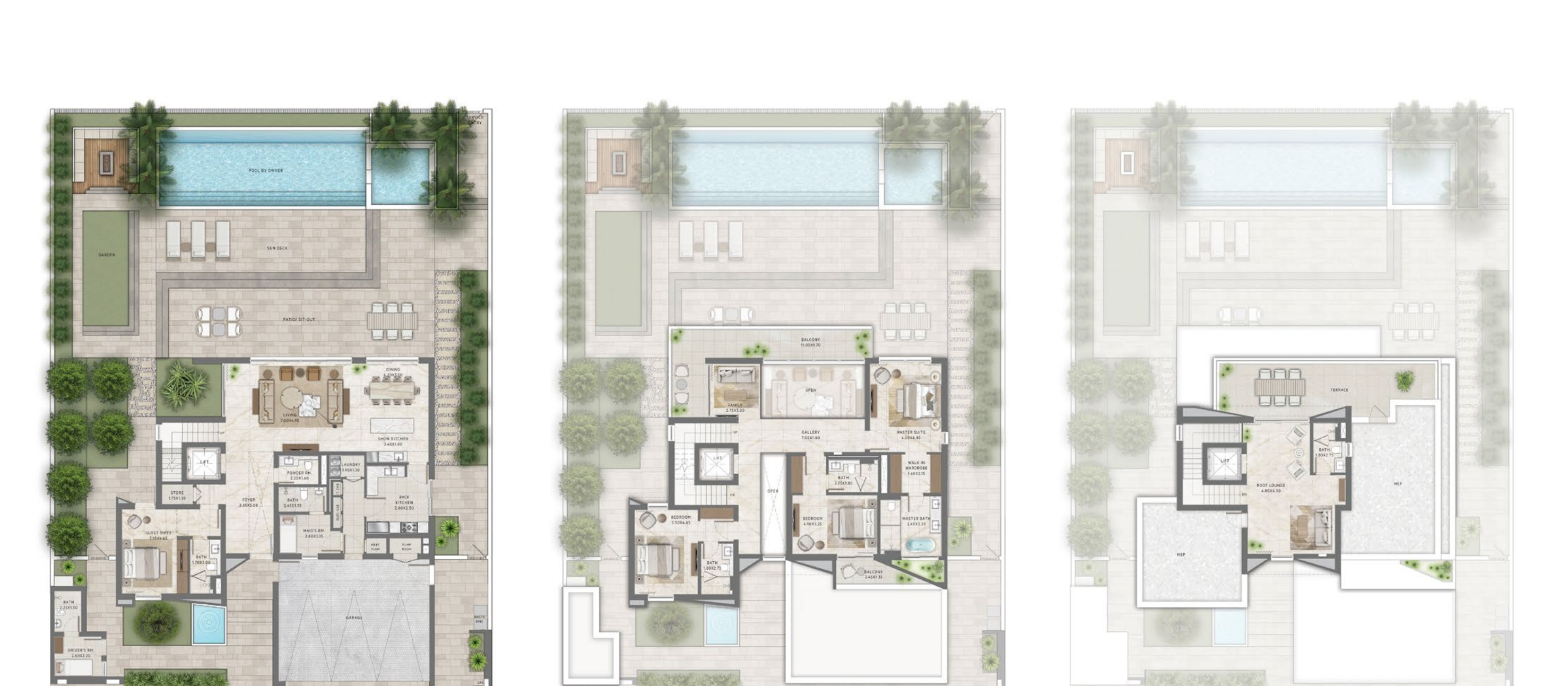
4-Bedroom Villa Chamfer