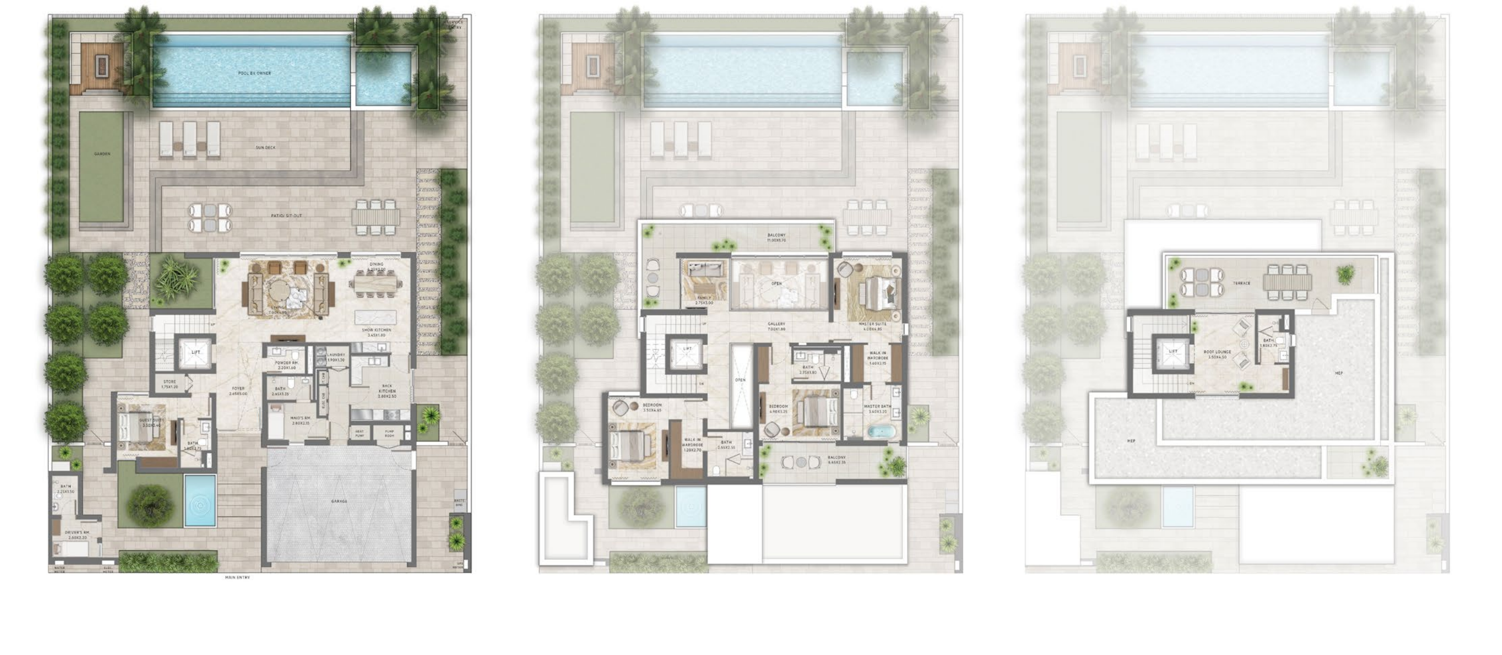
4-Bedroom Villa Contemporary